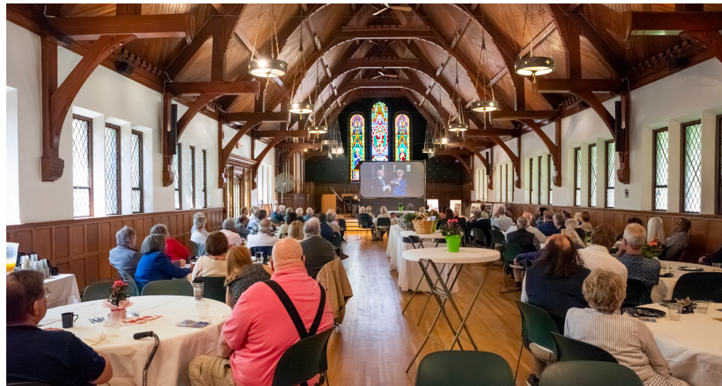
Cathedral Hall filled for campaign launch breakfast