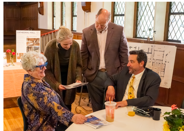
Marous Brothers presents renovation plans

Additional photos from the launch celebration can be found inside this issue. ❖