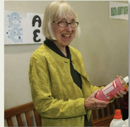
Trinity's Green Team is just one of the many groups working hard and having fun at the Cathedral.

For full program details and to learn more about Trinity Cathedral, visit www.trinitycleveland.org . At our website you can subscribe to our weekly email newsletter, listen to podcasts of sermons and forums, learn about our fellowship groups and neighborhood ministries and much more.